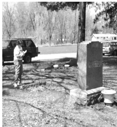
Yvette Hugan and Betty Turner reading their section of the cemetery.