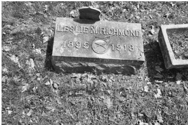
Taken at the Oak Lawn Cemetery Stockbridge, MI